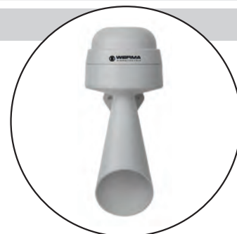
Loud, long-life horn for a diverse range of applications