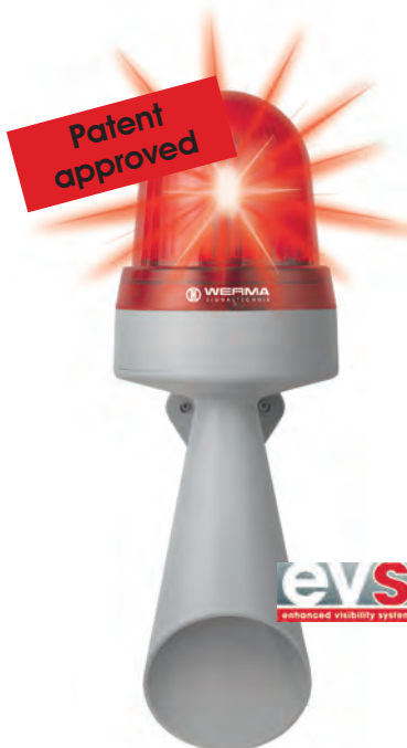
The "EVS"* light effect ensures a maximum attention-grabbing effect